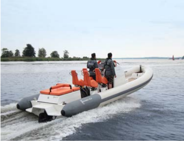
8.3M FAST TENDER