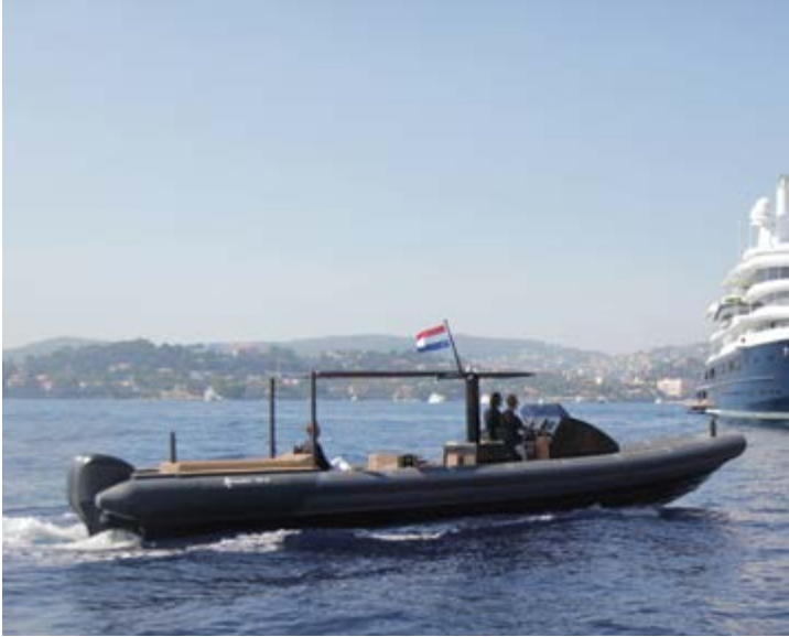
12.3M GUEST TENDER