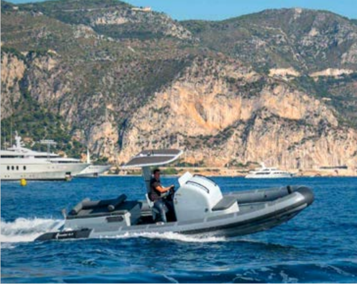
8.3M MULTI-P TENDER