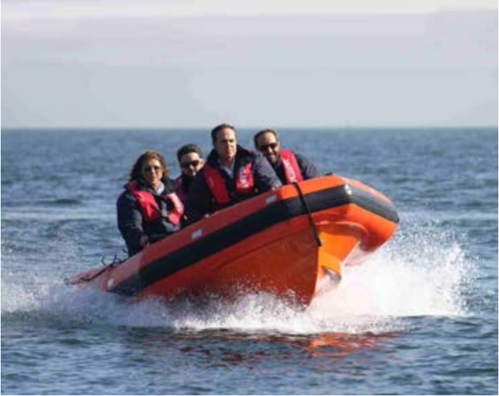
4.8M NARVAL SOLAS